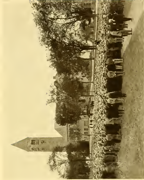
PRESIDENT'S ADDRESS TO NEW STUDENTS